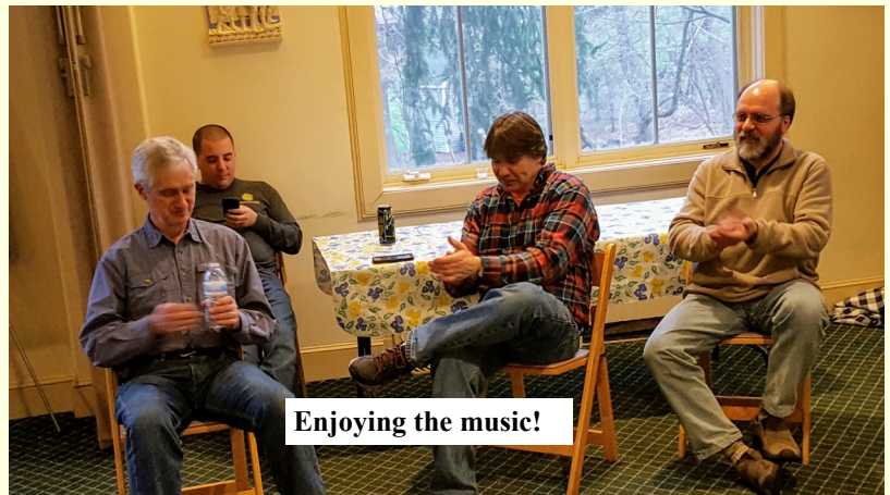
Enjoying the music!