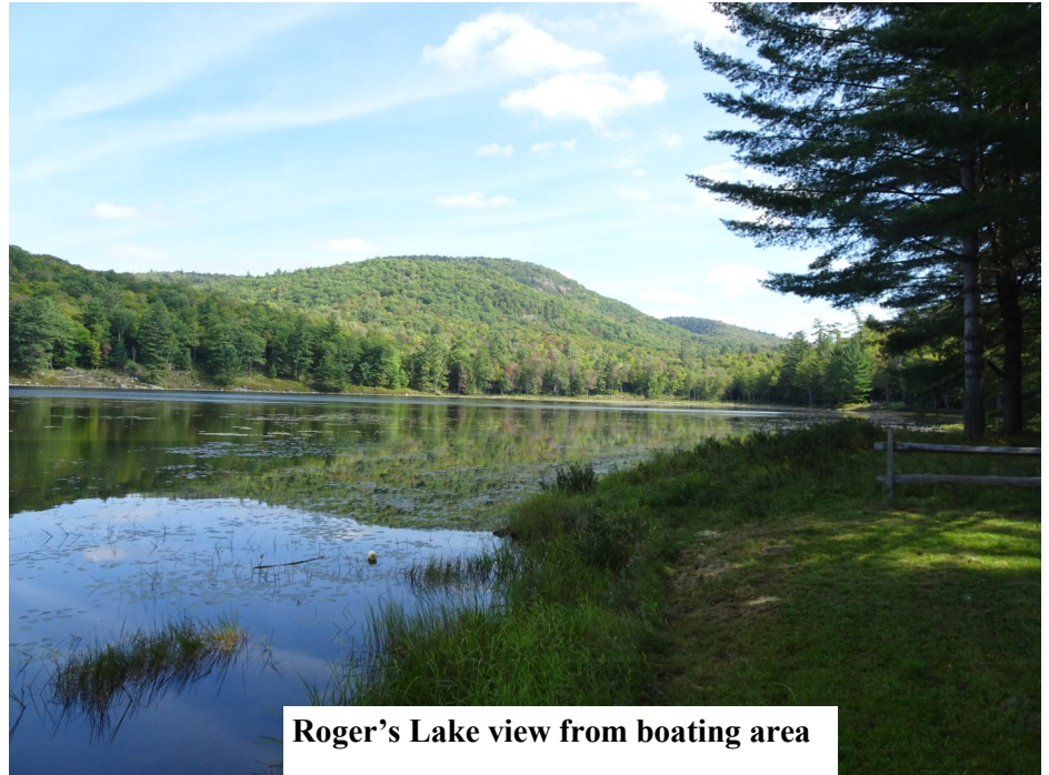
Roger's Lake view from boating area

Day to day life at the waterfront could be routine, filled with merit badge training, instructional swimming, general swims and boating. Each period we would also host a water carnival for all the troops to compete in and the occasional water polo patrol activity or mile swim. What really mixed things up for the Aquatics staff occurred during fourth period of my final year when we conducted an Aquatics Camp. This was for a limited number of scouts where they had the opportunity to earn all of the aquatics merit badges (swimming, lifesaving, rowing and canoeing) and culminated with a 4 day canoe trip through the Saranac Lakes region. This adventure had us going from lake to lake in the high peaks area, portaging when needed or going through locks to access the other lakes. We stayed on islands in the lakes at night and of course cooked our own meals. Scouts got the opportunity to utilize all of their scouting skills during the trip and I even got a bronze glow to my skin with all of this outdoor activity.