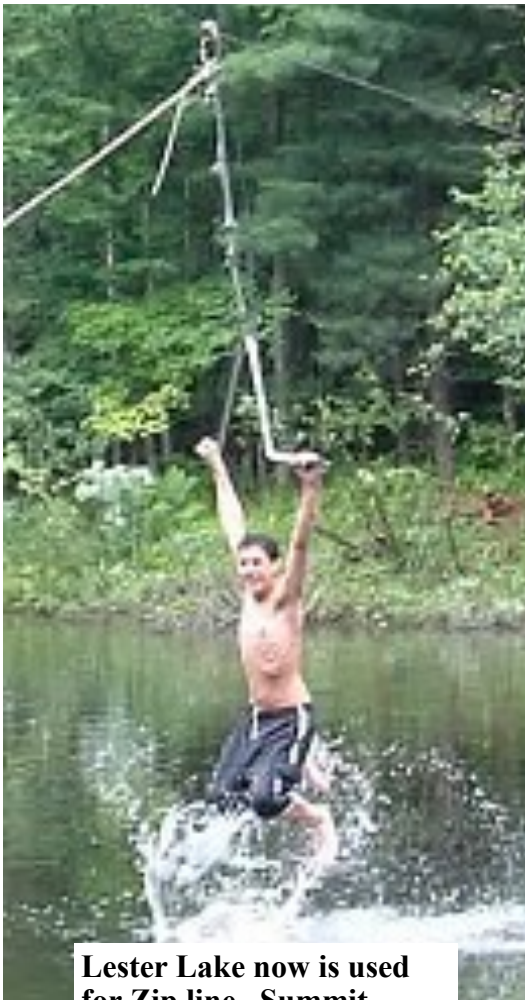
Lester Lake now is used for Zip line –Summit

Upon arrival at Schiff you are put into troops and patrols with other Scouters to learn your respective fields (Program Directors, Field sports, Camp Administration and of course Aquatics). Most course work was intensive but none as much as the Aquatics Camp. On top of doing in-site patrol type cooking for breakfast and dinners Aquatics persons were required to start their day in the water at 7am. It was a whirlwind throughout each day mastering your swimming strokes, lifesaving, rowing and canoeing skills, then back to help prepare dinner, followed by a lecture for the remainder of the evening. Whew!