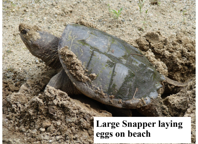
Large Snapper laying eggs on beach